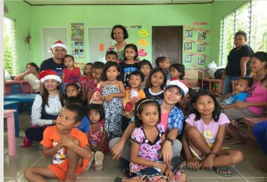
Group photo with the day care children and DSWD staff who assist us going to Manipis. 😊